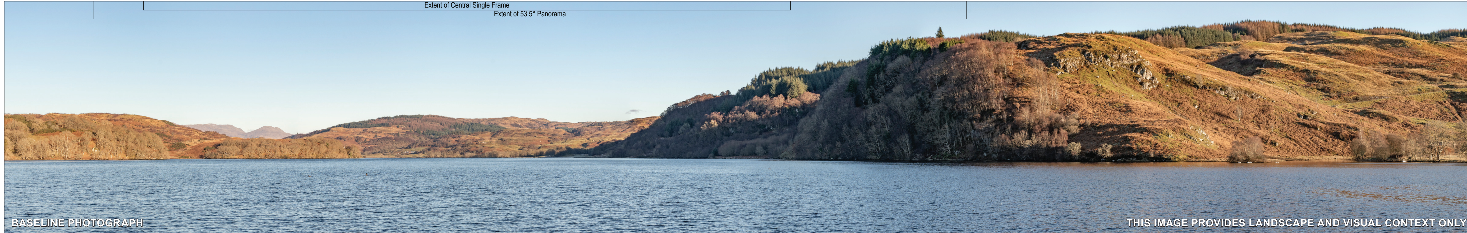
THIS IMAGE PROVIDES LANDSCAPE AND VISUAL CONTEXT ONLY